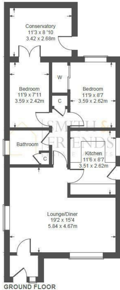
GROUND FLOOR Not to Scale. Produced by The Plan Portal 2024 For Illustrative Purposes Only.

Approximate Gross Internal Area 786 sq ft - 73 sq m